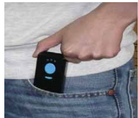
Drop-in-pocket design to carry smart